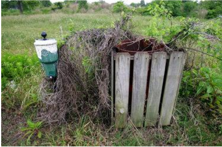
A golf ball washer and trash can are one of the few reminders of the former use of the overgrown and wild East and West courses in City Park.

Becker said designers have come up with a rough layout of the course, including how it will be graded and how the hole placement will protect existing trees.